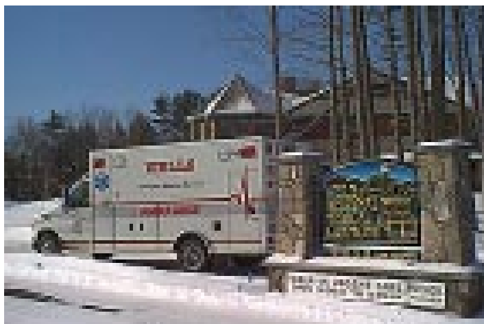
Rural EMS providers, like this one in Wells, Maine, face severe challenges in training and reimbursement.